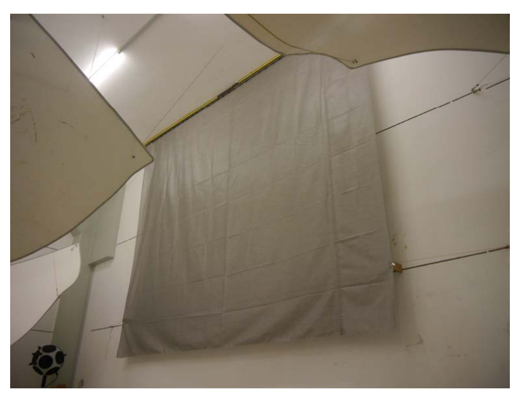
Figure B.2. Flat arrangement, test arrangement in the reverberation room: diagonal view.