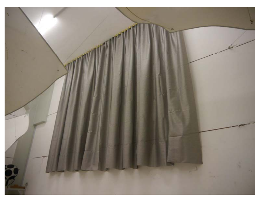
Figure B.4. Folded arrangement, test arrangement in the reverberation room: diagonal view.